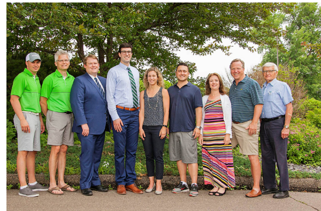
Members of Melchert Hubert Sjodin gather to celebrate our 33rd Annual Golf & Taste Celebration.